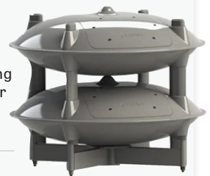
LRAD 360 XL