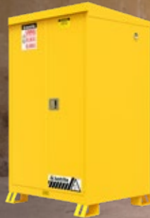
90G Outdoor Cabinet