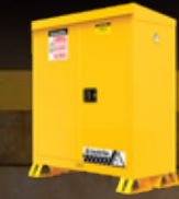
30G Outdoor Cabinet