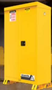
45G Outdoor Cabinet